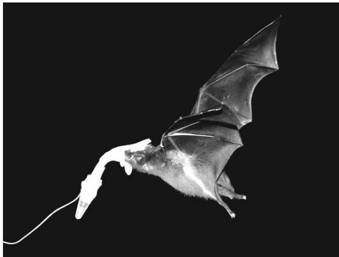
A nectar bat ( Anoura geoffroyi) visiting a flower ( Aphelandra acanthus) in a flight cage experiment designed to quantify pollen transfer.